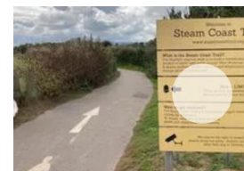
The stunning car-free route li Somerset coastal communiti