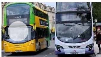
Major changes to bus routes across Somerset listed in full