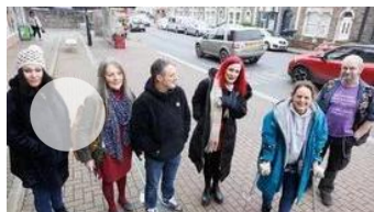
South West city has been turned 'into a prison' say fuming locals