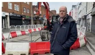
Council 'failing in its duty' over Bridgwater roadworks, says MP