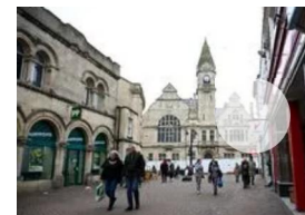
Inside 'dire' town with chester grater chairs which has seen days

Nail Fungus Hates This Trick (New Method from the USA!)