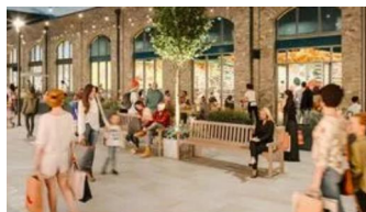
South West 'Ghost town' fears over new M5 shopping centre